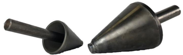
Part Number 984 End Shaper for Pipes Up to 3" in Diameter